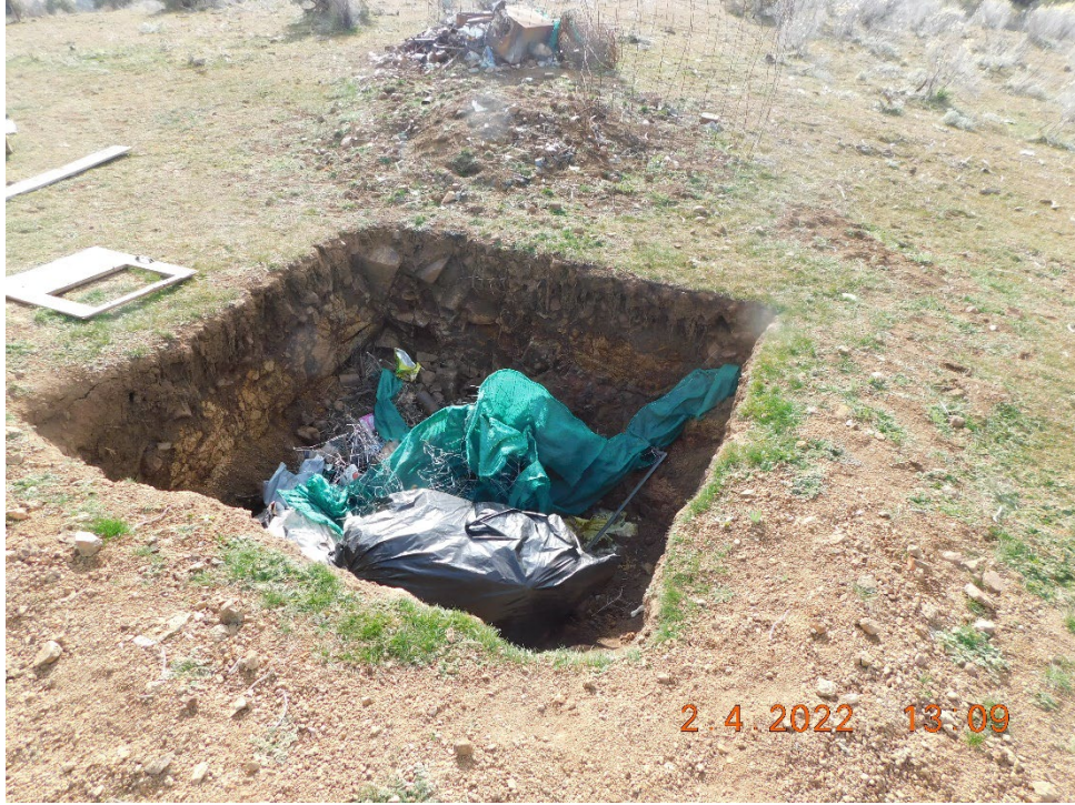
Figure 2: Trash Pit