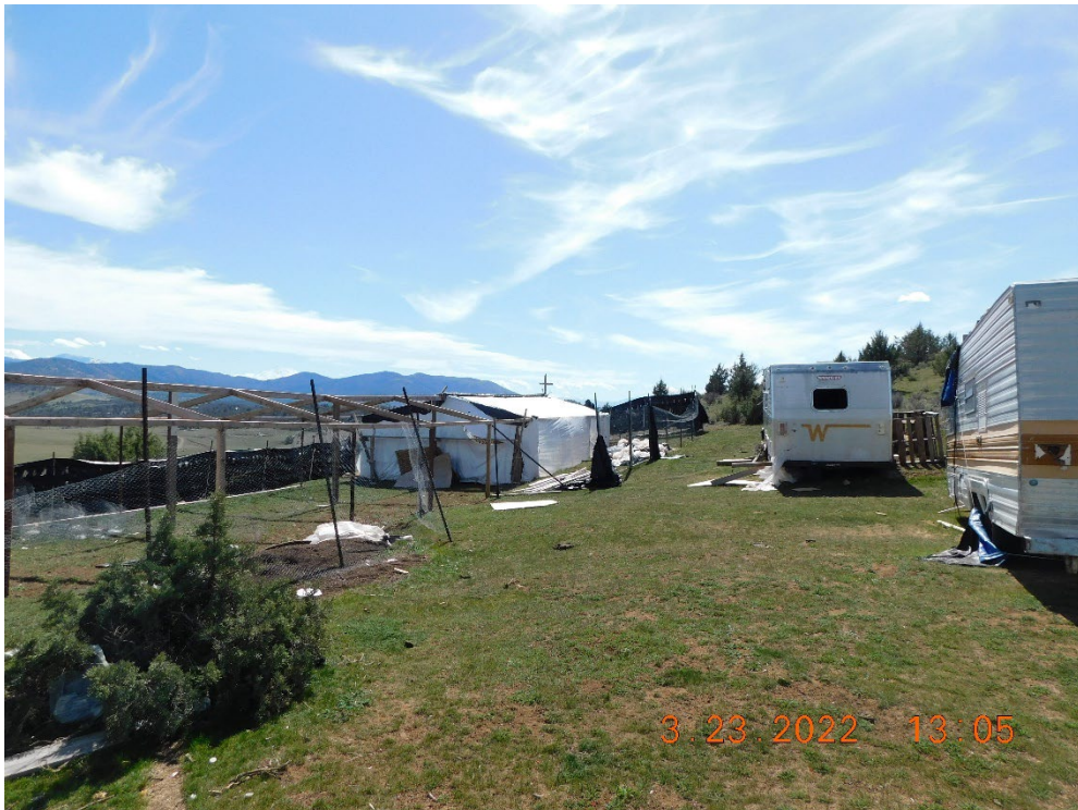
Figure 5: Facing Southwest