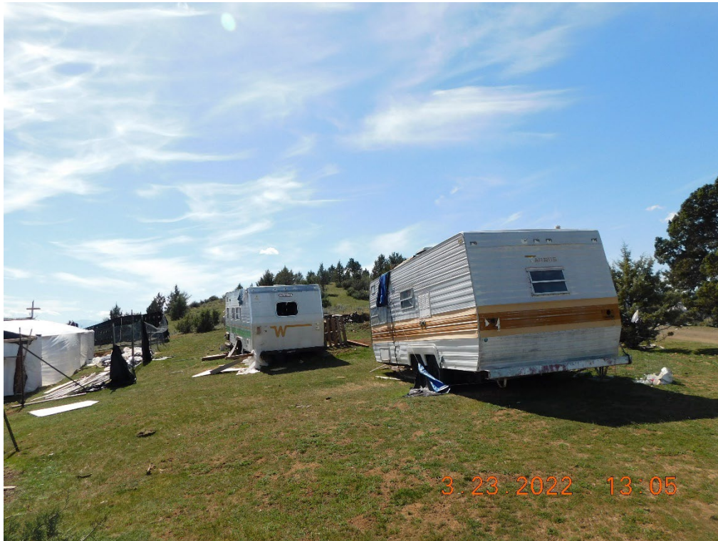
Figure 6: Facing Southwest