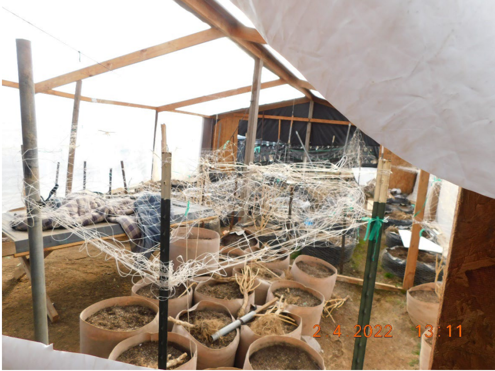
Figure 4: Greenhouse