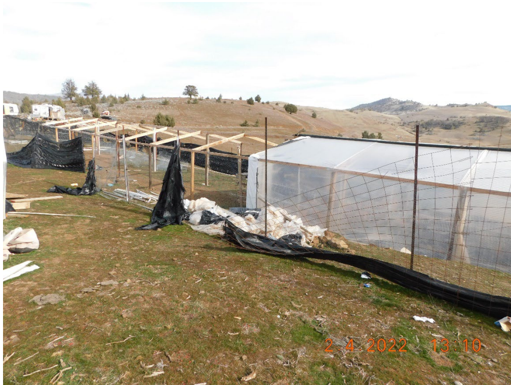
Figure 3: Facing Southeast